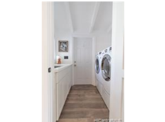
Laundry room with sink and extra storage.