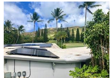
Some golf course and mountain views.