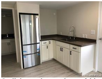
Stylish wet bar and new fridge.