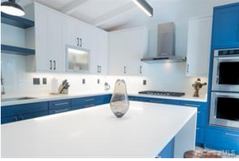
Any chef would love creating a feast here- Bon Appetit!