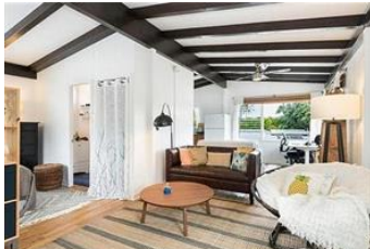
The Loft living area.