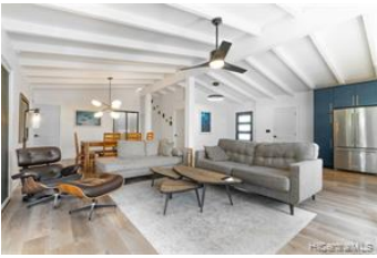
The grand family room in the main part of the home.