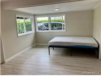
The studio has room for a bed or use it how you would like - maybe an artists studio, a gym, home office, home school - lots of possibilities.

© HiCentral MLS, Ltd.®. All rights reserved. Information herein deemed reliable but not guaranteed. Generated on 05/13/2021 10:40:27 AM