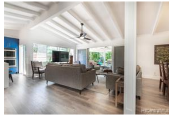
Another view of the living, dining and kitchen area - looking out towards the covered lanai.