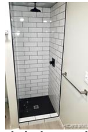
The sleek design continues in the studio bath and shower.