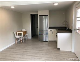
Studio or recreation room with wet bar.