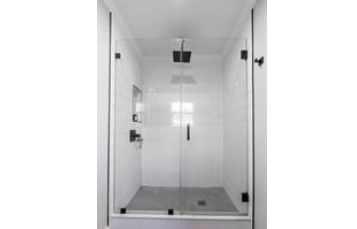
Large walk in rain shower with contemporary flare.