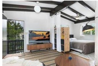
The Loft living area looking towards sleeping area.