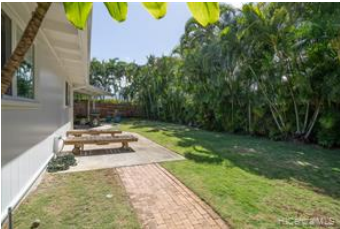
Side yard is ready for your lap pool or just keep it for your pets!