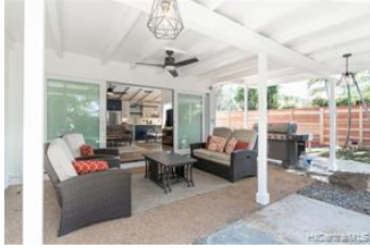
The covered lanai is great for entertaining and gives you extra living space.