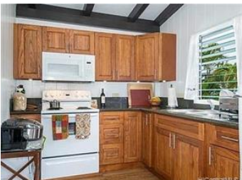
Kitchen in the Loft.