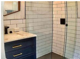
Walk in shower in Loft bath.