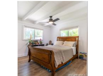
Light and airy bedroom with vaulted ceiling.