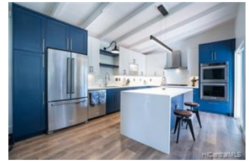
Wow! Kailua Beach Blue designer kitchen with stainless appliances, contemporary lighting and room for many!