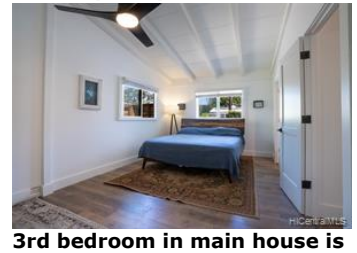
3rd bedroom in main house is also bright and airy with new ceiling fan.