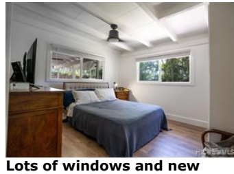
Lots of windows and new ceiling fans keep the bedrooms cool.