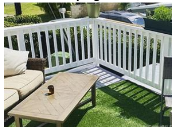
Deck area off of the loft area.