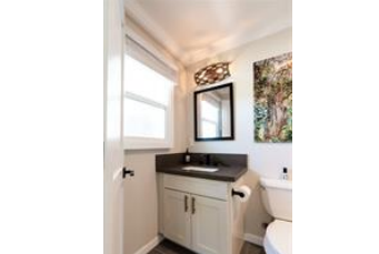
The baths have a sleek design.