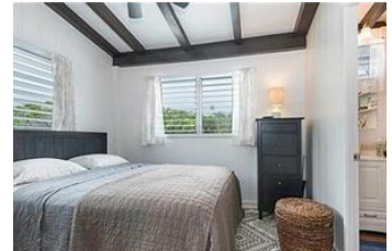
Sleeping area in the Loft with windows has nice views.