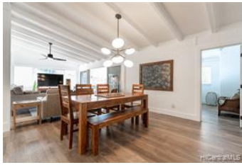
Dining area of the main home - vaulted ceilings and a cool sophisticated light!