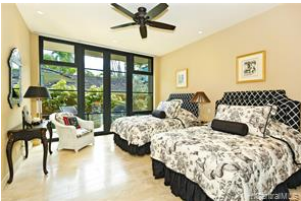
Downstairs middle bedroom