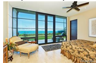
Downstairs front bedroom