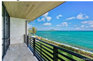
Deck off the Den