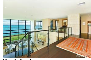
Upstairs breeze way

© HiCentral MLS, Ltd.®. All rights reserved. Information herein deemed reliable but not guaranteed. Generated on 07/08/2019 12:34:31 PM