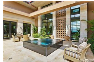
Courtyard and entry