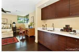
Guest suite with wet bar