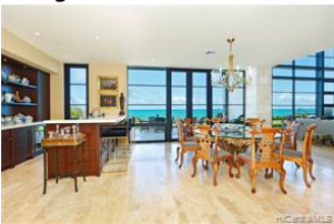
Bar and dining area