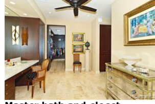
Master bath and closet