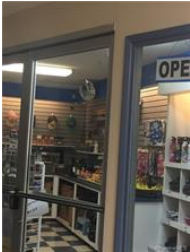
Mini Mart on the 5th floor