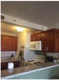
newly renovated kitchen