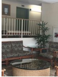
Lounge on the 6th floor