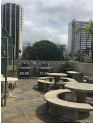
BBQ and picnic tables on the 6th floor