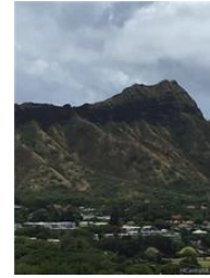
Diamond Head view