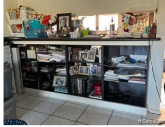
built in book shelves