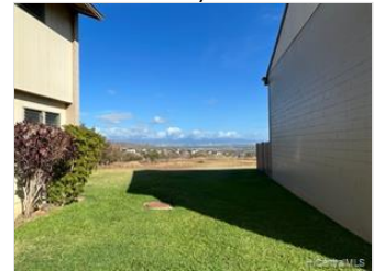
common area between bldgs