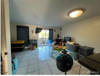
living room to lanai view