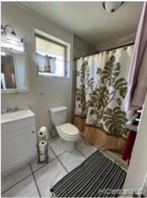
upstairs full bath