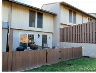
common area to lanai view