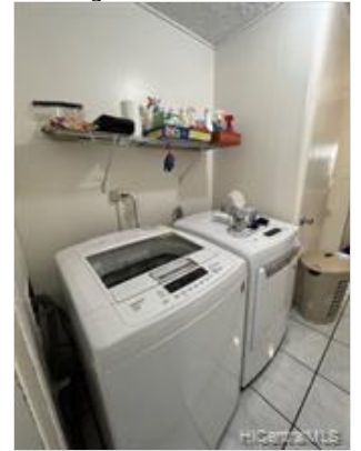
washer dryer are