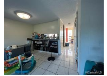
living room to kitchen view