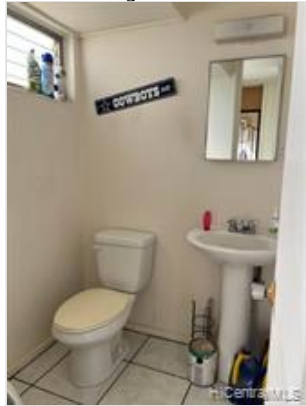
downstairs half bath