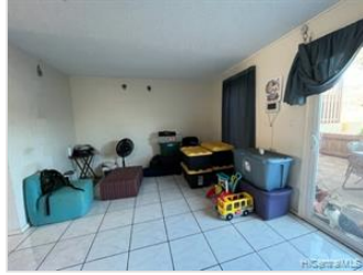
living room nook